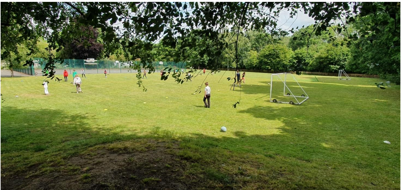
Our school playing field

The broad range of cultural activities we offer at Newnham Croft is integral in ensuring a high level of inclusion, commitment to racial equality and a mature response to cultural diversity from our pupils.