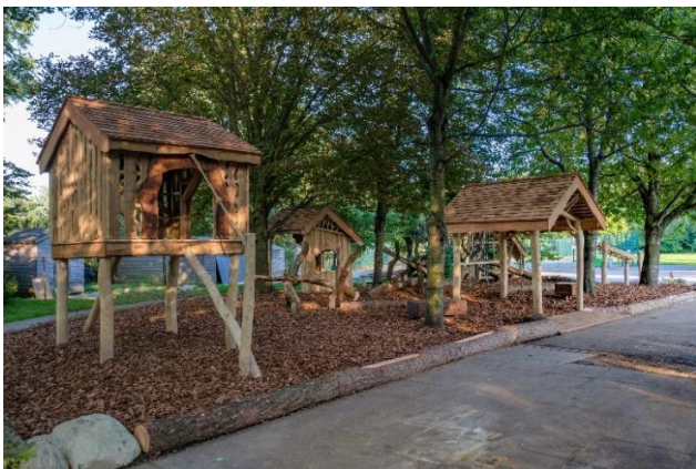
Our island play structures

The atmosphere throughout the school is friendly, warm and collaborative.