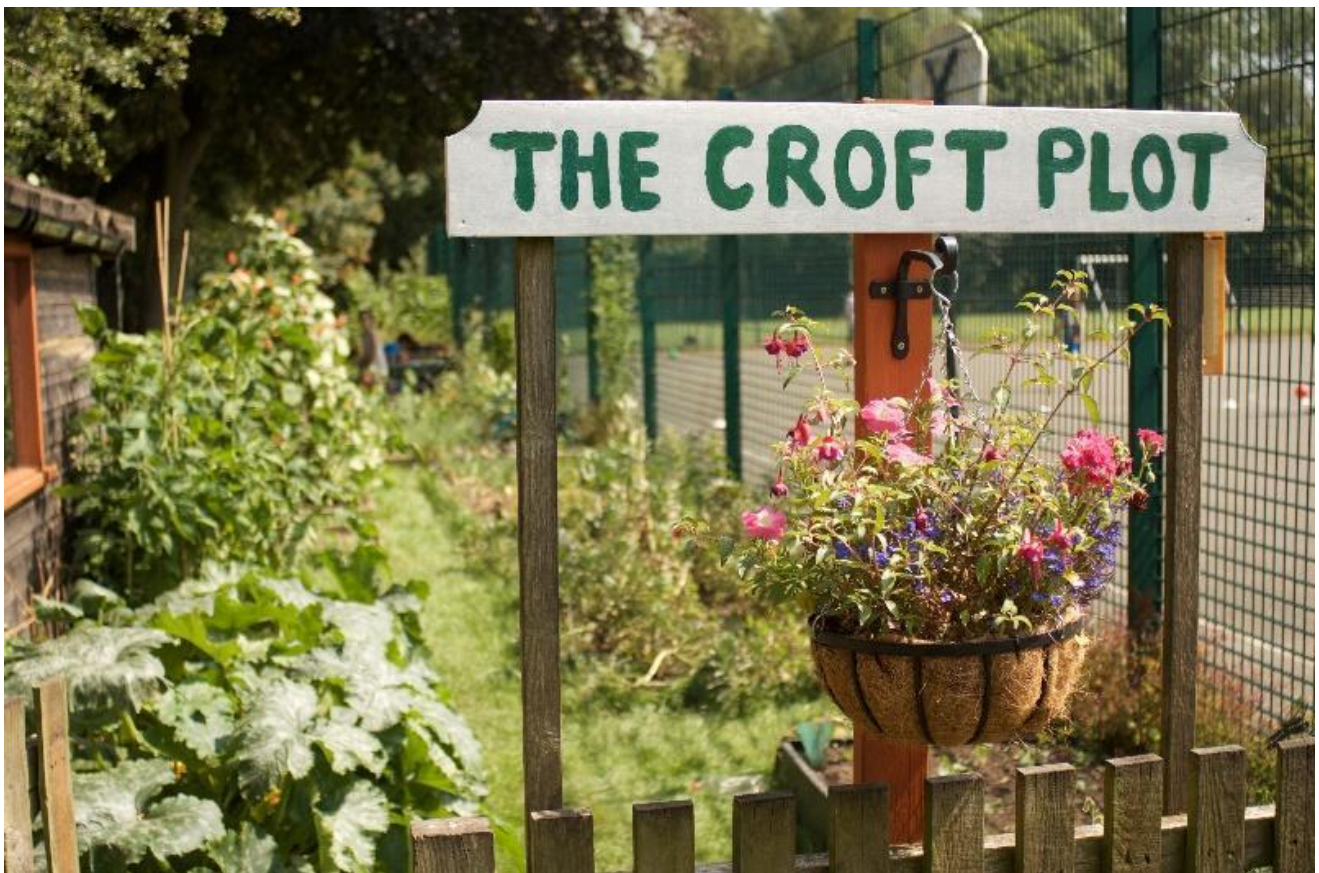
The Croft Plot growing garden

In Key Stage 2, there are four single year group classes, one for each year group (Years 3, 4, 5 and 6). Each class is taught the curriculum within their year group, but share topic work with another year group in the same phase of the school (Year 1 & 2, Year 3 & 4 and Year 5 & 6). This promotes interaction and collaboration, and older KS2 children will also take part in activities with Rec/KS1 children, giving them a sense of responsibility and the younger children a sense of belonging to a bigger school 'family'.