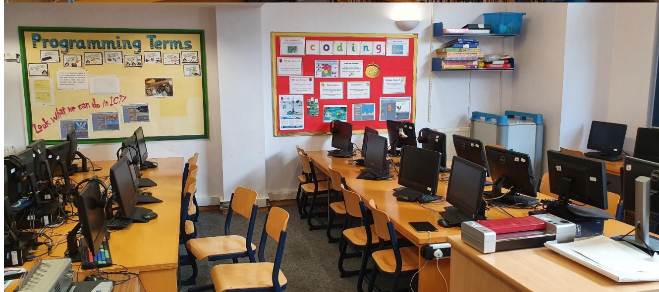
The school Library and Computer suite