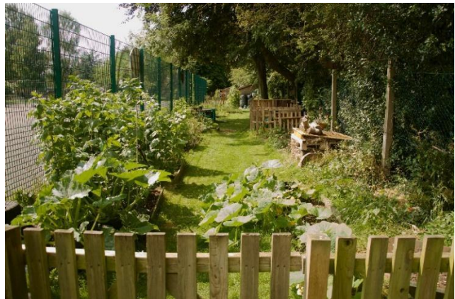
Our vegetable garden