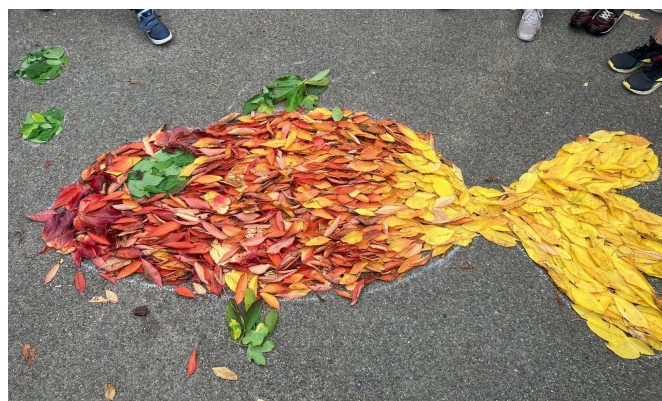
Playground fish by Y6

Also, Year 6, don't forget to apply for secondary school by midnight on Thursday 31 October. See admissions website for more information.