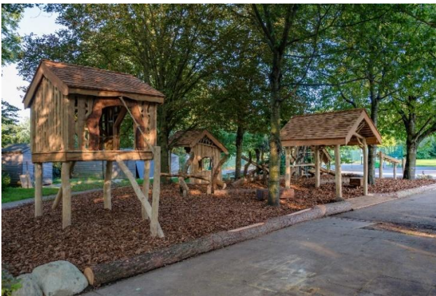
Our island play structures

The atmosphere throughout the school is friendly, warm and collaborative.