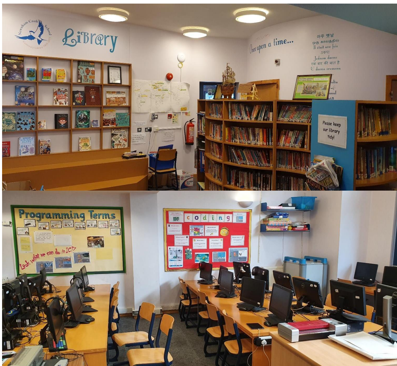
The school Library and Computer suite