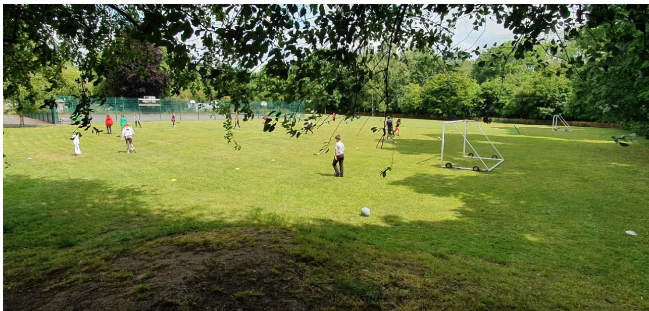
Our school playing field

The broad range of cultural activities we offer at Newnham Croft is integral in ensuring a high level of inclusion, commitment to racial equality and a mature response to cultural diversity from our pupils.